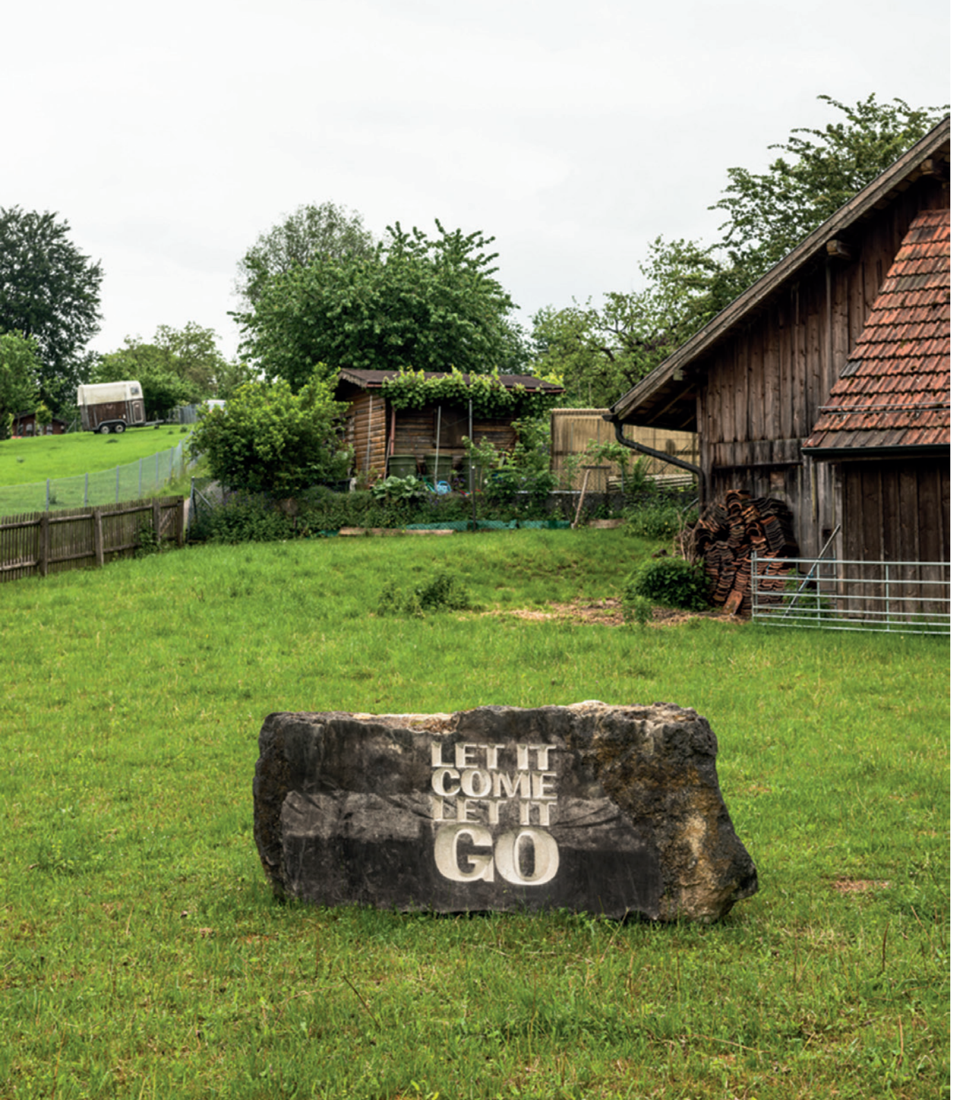
Installation view, John Giorno, LET IT COME LET IT GO (Monument Edition), Zurich, 2018