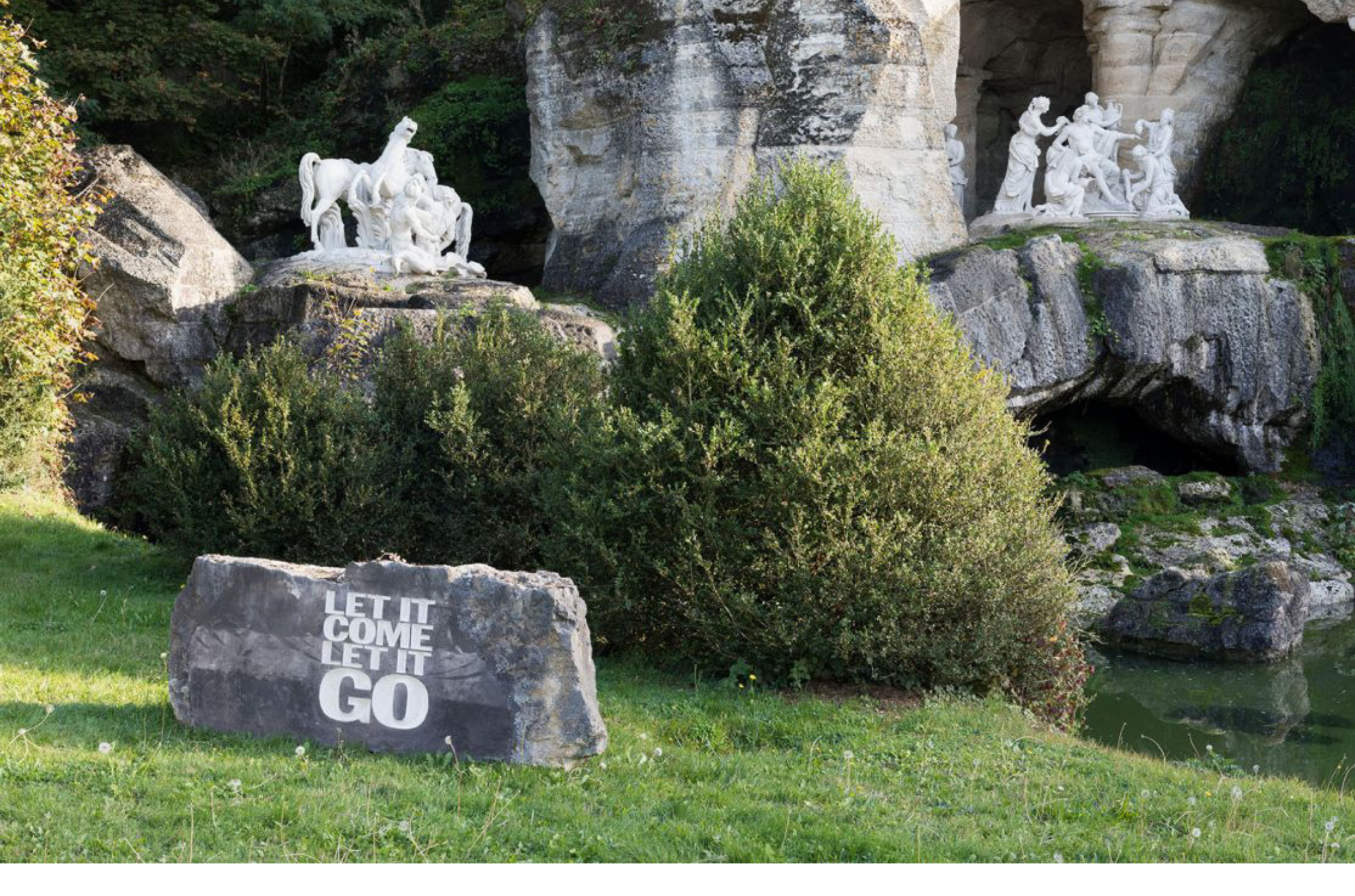
Installation view, John Giorno, LET IT COME LET IT GO (Monument Edition), Château de Versailles, 2017